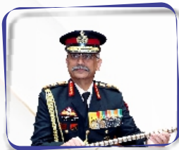
General M M Narawane (Retd)